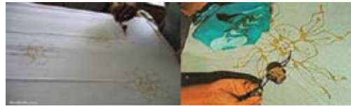
Figure 2 (a-b) – Applying wax on the cloth