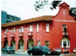
Figure 7 – Malacca Art Gallery and Batik painting exhibition