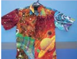
Figure 9 – 2 Batik Shirt for Angkasawan