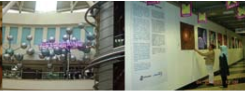
Figure 8 – Petrosains and Batik painting exhibition