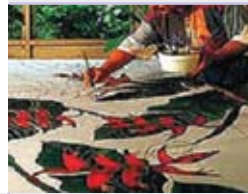
Figure 3 – Applying dye on the cloth