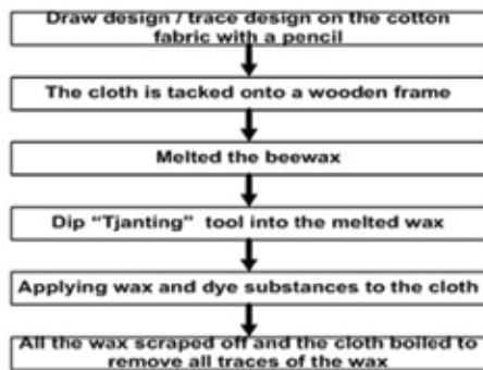
Figure 1 – "Tjanting" Batik making process.