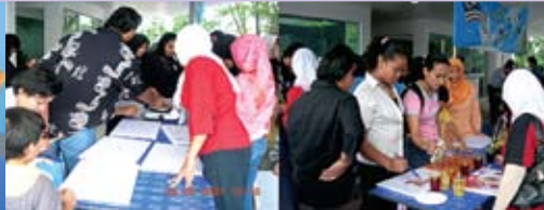
Figure 10 – Space Batik Art Activity