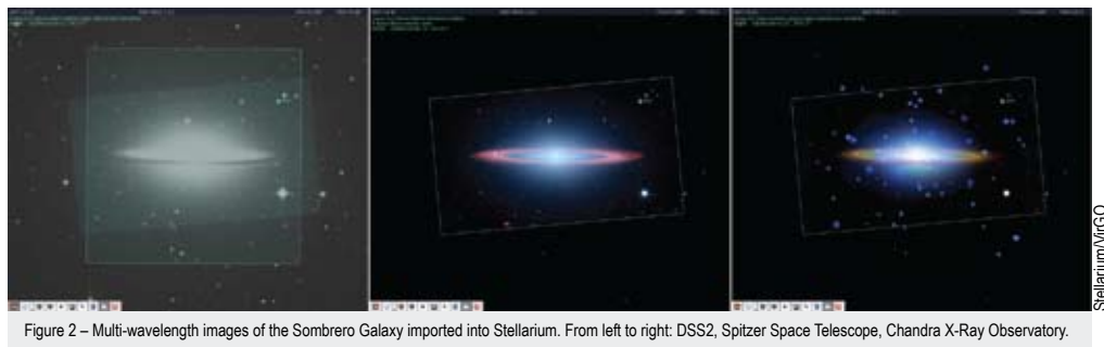
Figure 2 – Multi-wavelength images of the Sombrero Galaxy imported into Stellarium. From left to right: DSS2, Spitzer Space Telescope, Chandra X-Ray Observatory.

natively read AVM, and make better use of the WCS and contextual information (e.g. headline, description, colour mapping, etc.) stored in the metadata. The possibilities for the interconnection and exploitation of these resources are virtually endless.