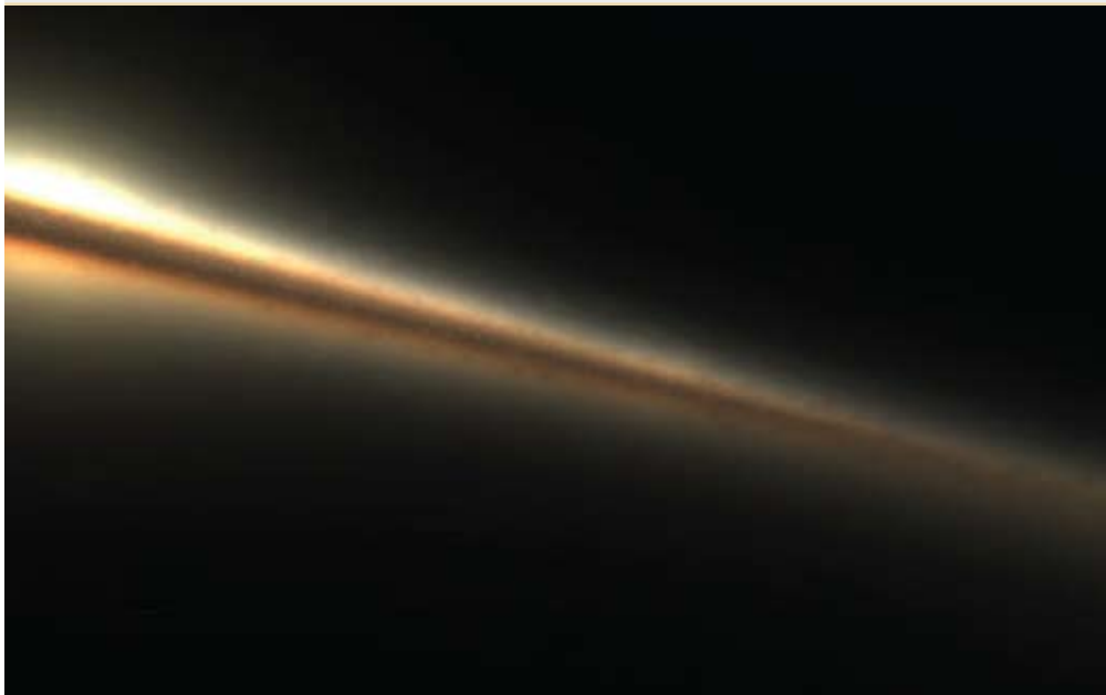
Figure 1 – Particle system Oort cloud 3D model in Uniview. Data from Tsunehiko Kato & 4D2U, NAO, Japan.