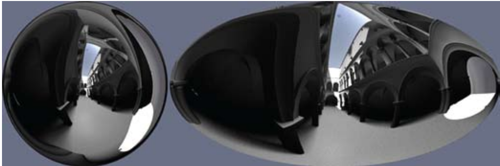
Figure 2 – A render of a scene using WFCam4D showing a full 360° field of view, in Fisheye and Aitoff projections.