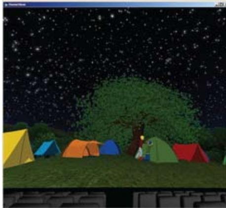
Figure 3 – A 3D view of the projection in the planetarium, as seen from the dome centre.