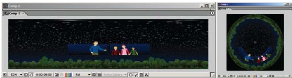
Figure 1 – A fulldome frame in Fisheye and Cylindrical projection.

A tool, called the FullDome plugin 1 , was designed to handle all the different aspects of dome content compositing/editing in the form of a plugin for Adobe After Effects 2 . Besides being able to distort the content to adapt for the curved surface screen, the software is able to place the footage in a specified position on the dome, now defined in terms of altitude (reference is the spring line) and azimuth (reference is North). A set of astronomical features is available that enable the precise location on the celestial sphere to be set, as well as simulating many astronomical phenomena. Although conceptually, the hemispherical surface tends to be more difficult compared with the traditional flat screen, the use of the plugin is very intuitive. The user imports content to the composition, sets up all the necessary parameters associated with the kind of input footage used, such as place and size.